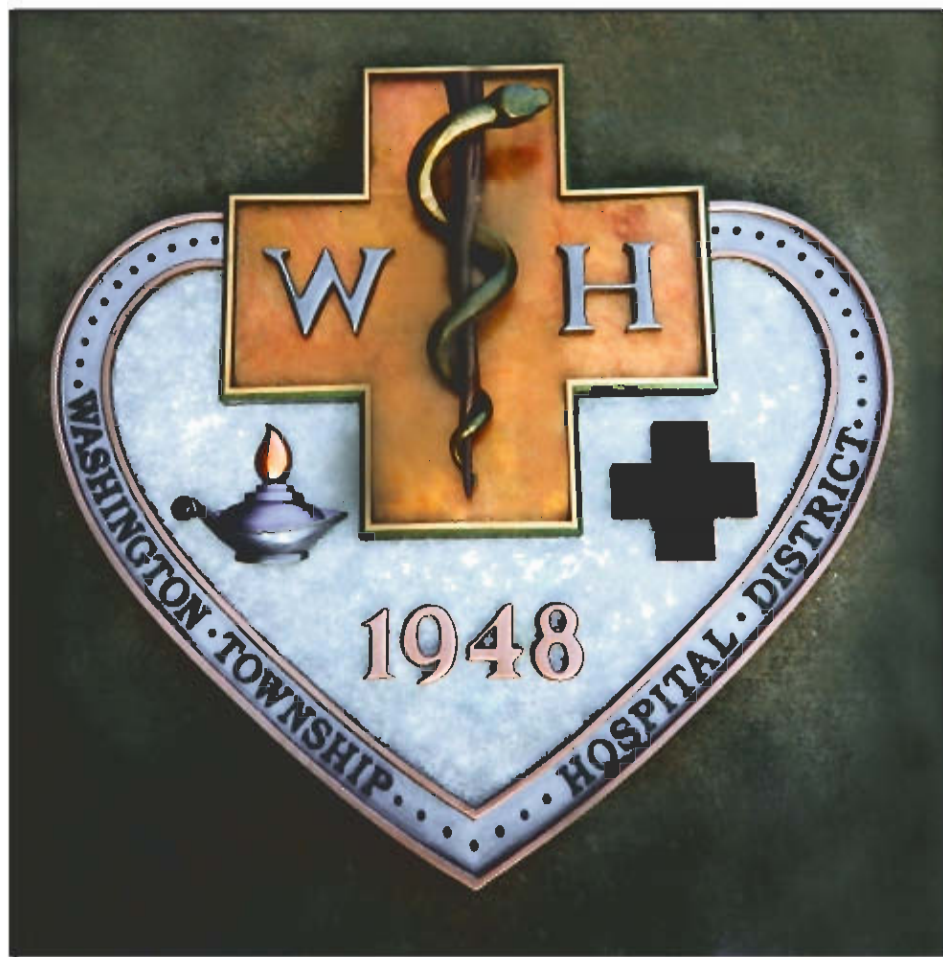
▲ Bennett Hall Images emblem design for the Washington Township Hospital District.

The photo exhibit, hung in the public areas of Washington West,