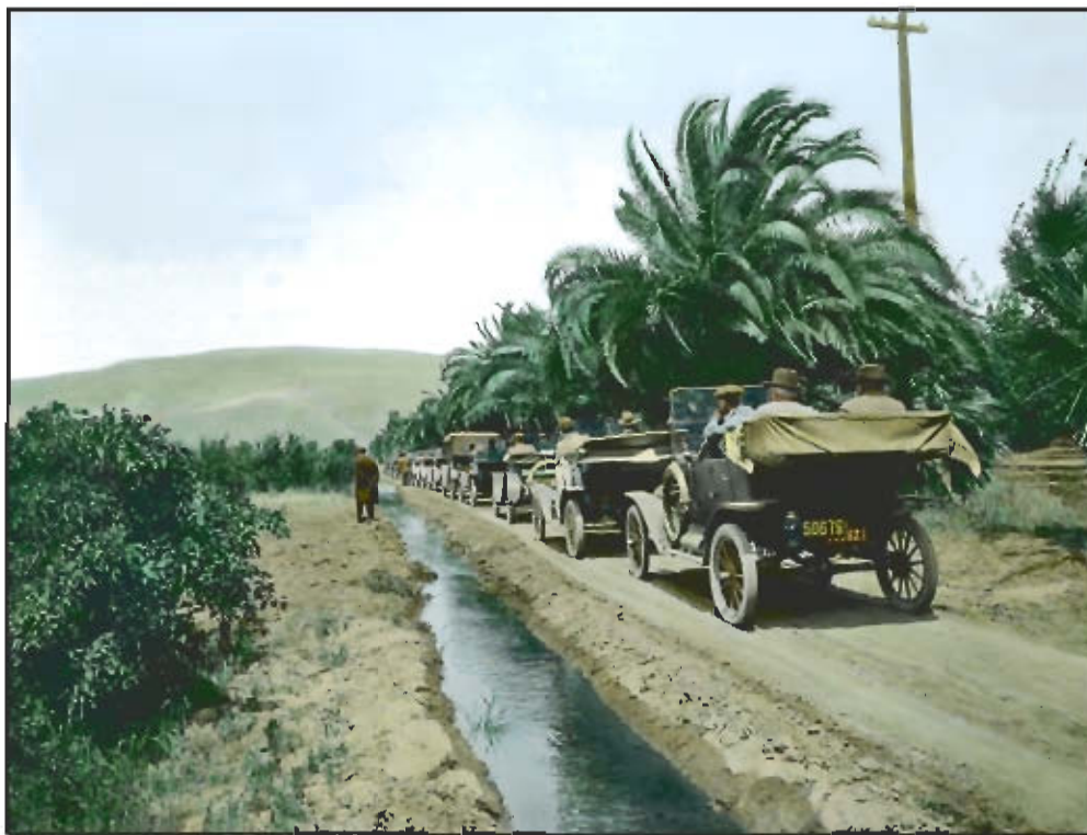
▲ Prospective buyers tour the grounds of the California Nursery Co., the company responsible for landscaping William Randolph Hearst's castle. The photo is part of the Washington West exhibit.