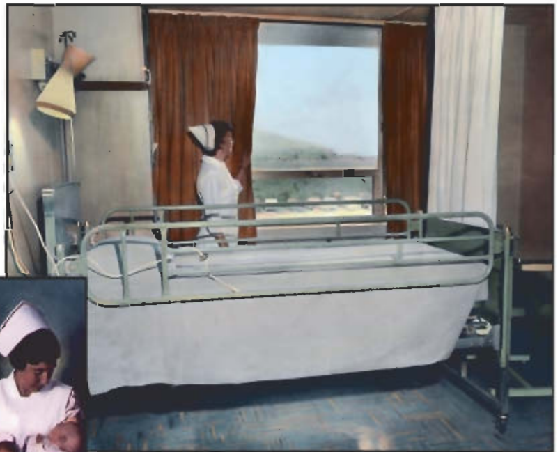
▶ A nurse surveys the then-virgin landscape from a window in Washington Hospital in Fremont, Calif., circa 1960.